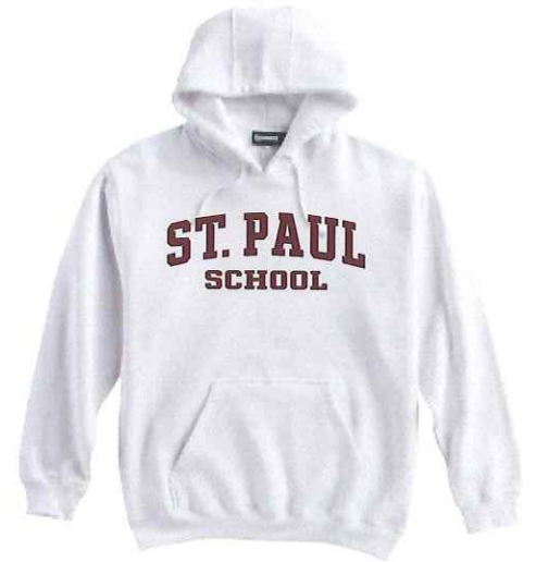
White Cotton Hoody $30