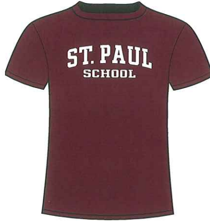
Maroon Cotton Tee $8 Maroon Poly Tee $10