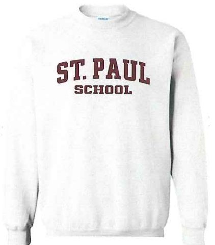
White Cotton Crewneck $25

Above items are available in YS, YM, YL, YXL, AS, AM, AL, AXL, AXXL, A3XL)