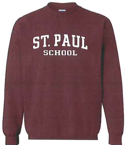
Maroon Cotton Crewneck $25