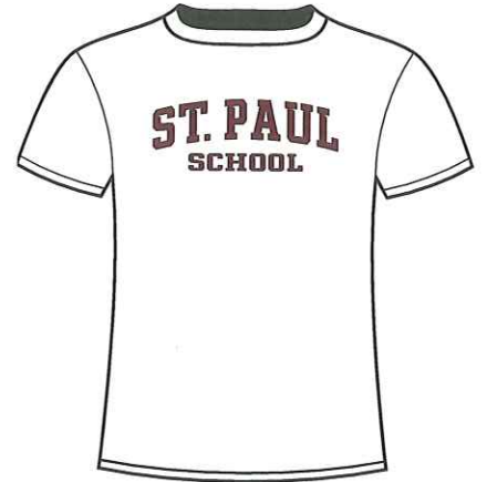
White Cotton Tee $8 White Poly Tee $10