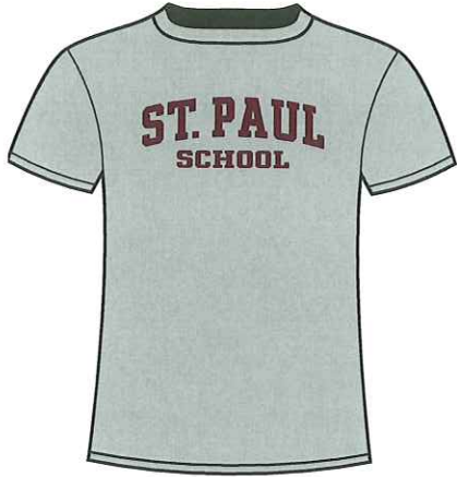
Grey Cotton Tee $8 Grey Poly Tee $10