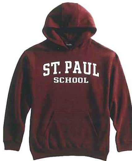
Maroon Cotton Hoody $30