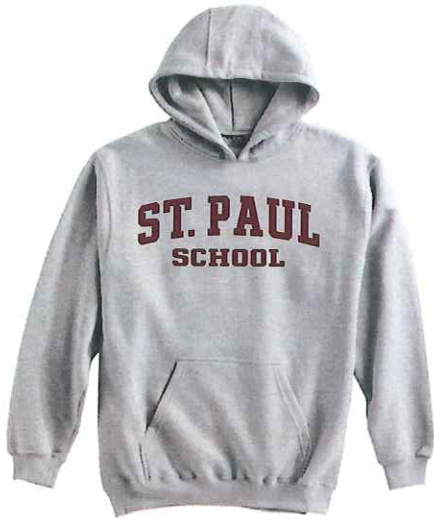
Grey Cotton Hoody $30